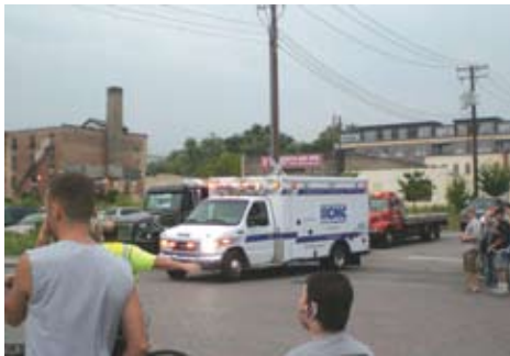
A Hennepin ambulance arrives at the scene of the 35W bridge collapse.

Hennepin County Medical Center and Hennepin Faculty Associates physicians have provided emergency medical services (EMS) to Minneapolis and the surrounding area for over 100 years. The Primary Service Area for Hennepin EMS covers 14 communities, approximately 266 square miles, and serves the residents in Hennepin County. The ambulance service responds to approximately 55,000 calls per year.