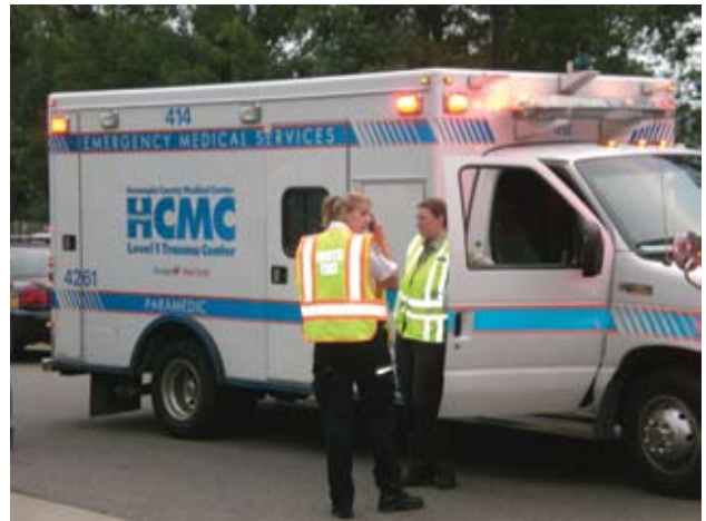
EMS teams coordinating efforts.

From pre-hospital to Emergency Department, the depth and breadth of medical research means that Hennepin patients are getting the most cutting-edge treatment found anywhere. When it comes to a critical illness or injury, patients who know say, " Take me to Hennepin County Medical Center! "