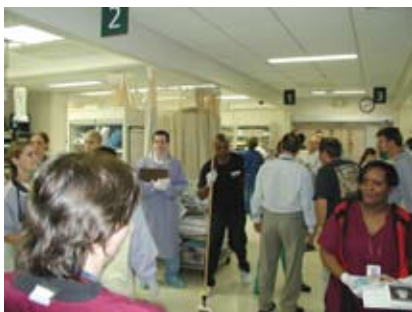
The ER springs into action with the arrival of the injured from 35W.

Approximately 100,000 patients visit the Emergency Department at Hennepin County Medical Center annually. Board certified Emergency Medicine physicians from Hennepin Faculty Associates provide 24-hour coverage and out-state emergency consultation. Nurses receive and participate in teaching specialized training in handling trauma and medical emergencies, including Advanced Cardiac Life Support, Traumatic Nursing Core Course, and Advanced Pediatric Life Support.