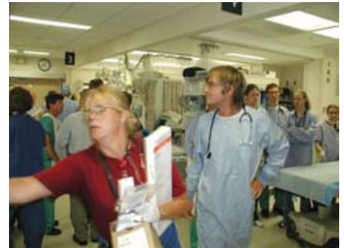
Hennepin staff prepare to receive the injured from the 35W bridge disaster.