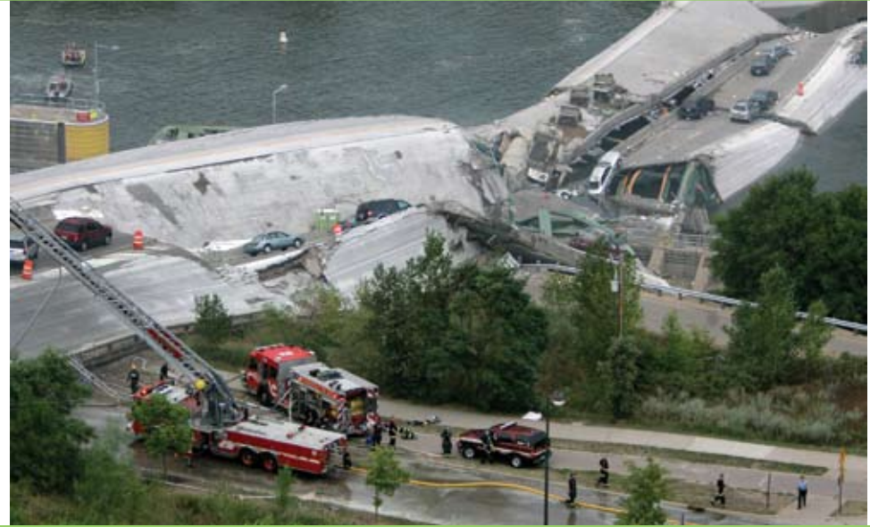
Emergency first responders rescue victims on the 35W bridge.

The Newsletter of the Minneapolis Medical Research Foundation at Hennepin County Medical Center